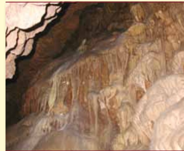
Glijajama v zaselku Planinska vas, kjer je izvir reke Bistrice Glijajama Cave in the small village Planinska vas, where the source of the River Bistrica is found.

Planina se prvič omenja leta 190 kot vinogradna vas, leta 1345 kot trg, leta 1588 pa kot trg z obzidjem. Leta 1494 so Planino opustošili Turki. Leta 1646 je kuga na Planini in njeni ožji okolici zahtevala tisoč žrtev. V spomin na ta dogodek so postavili kamniti steber v Visočah. V letih 1515, 1573, 1635, in 1790 so bili na Planini večji oziroma manjši kmečki upori. Požari so trg večkrat uničili, zadnji večji požar je bil leta 1944.