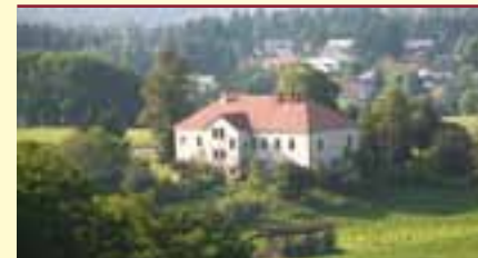
Šentvid pri Planini (legenda pravi, da sta se v šentviški cerkvi skrivaj poročila Veronika Deseniška in grof Friderik Celjski) Šentvid pri Planini (a legend says that Veronika Deseniška and Count Friderik of Celje were married in secret in the Church of Šentvid).