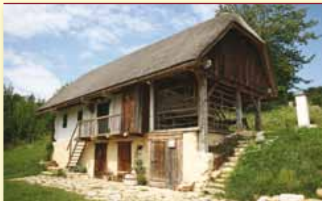
Obnovljena kozjanska domačija v Ravnem A restored Kozjansko homestead in Ravno

The municipality is connected to the neighbouring municipality by Guzaj's Path, where the eye rests in admiration on agreeable forest and meadow greenery, where wild deer still roam and the ear catches the joyful singing of the birds up in the tree tops.