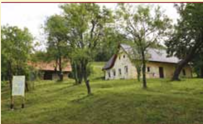
Košnica (Drobneta gostilna) – pred kletjo je bil na begu 10. septembra 1880 ustreljen Guzaj. Košnica: Guzaj was shot on 10 th September 1880 in front of the cellar, while on the run.

Označena pešpot » Na poti z Guzajem « poteka mimo 15 zanimivih točk, ki vam bodo približale bogato kulturno in naravno dediščino tega kraja.