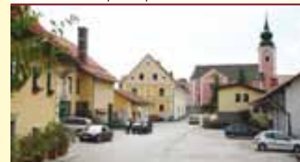
Središče Dobja - The centre of Dobje