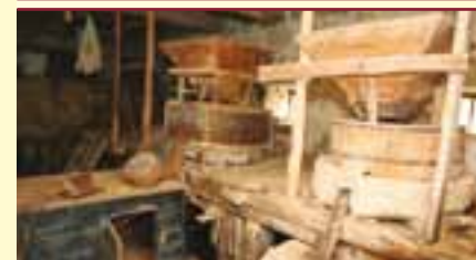
Notranjost Zupanovega – Laprškovega mlina The interior of the Zupan – Lapršek mill.