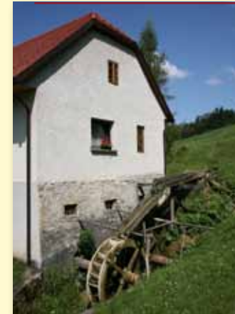
Eden izmed 3 ohranjenih mlinov v dolini Bistrice Zupanov – Laperšekov mlin One of the 3 preserved mills in the valley of Bistrica, the Zupan – Lapršek mill.