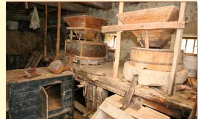
Notranjost Zupanovega – Laperškovega mlina The interior of the Zupan – Lapršek mill.