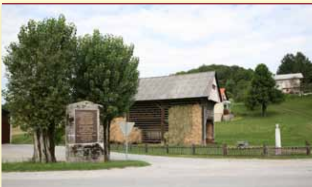
Žegar: spomenik graditelju ceste (l. 1915), kužno znamenje (l. 1644) Žegar: monument to the road builder (1915), plague mark (1644).