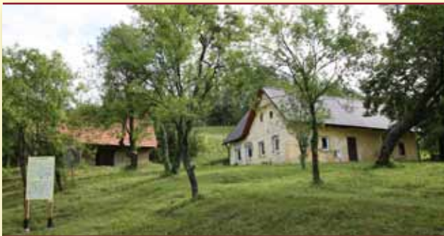
Košnica (Drobnetova gostilna) – pred kletjo je bil na begu 10. septembra 1880 ustreljen Guzaj. Košnica: Guzaj was shot on 10 th September 1880 in front of the cellar, while on the run.