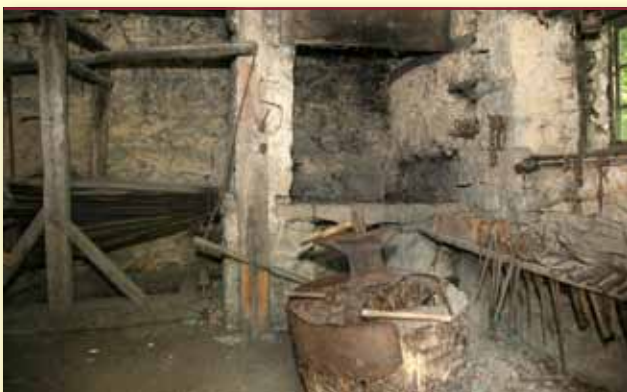
Ohranjena kovačnica pri Obrezu v Žegru The preserved forge at Obrez in Žeger.